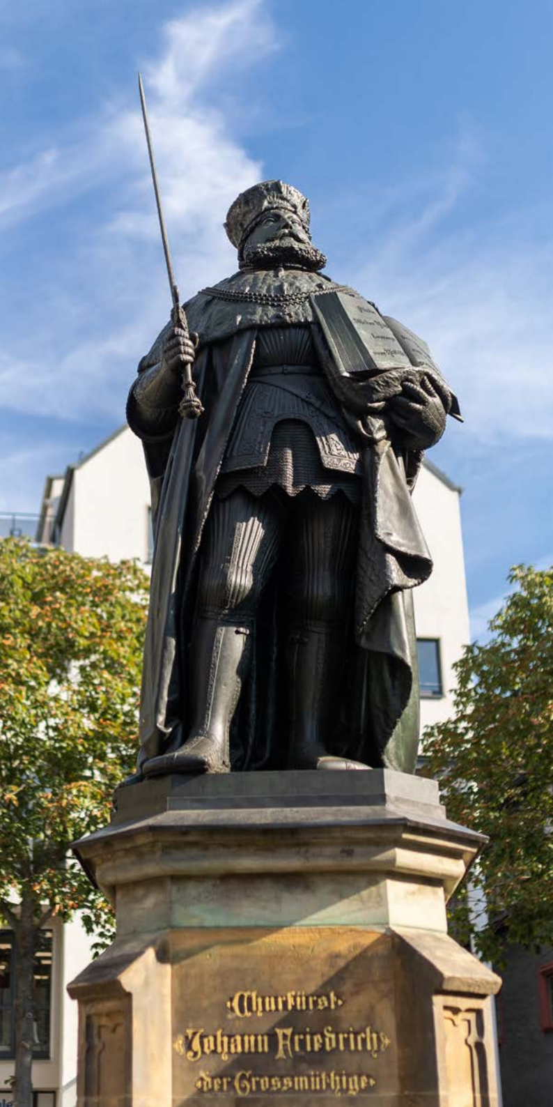
Churfürst Johann Friedrich der Grossmüthige